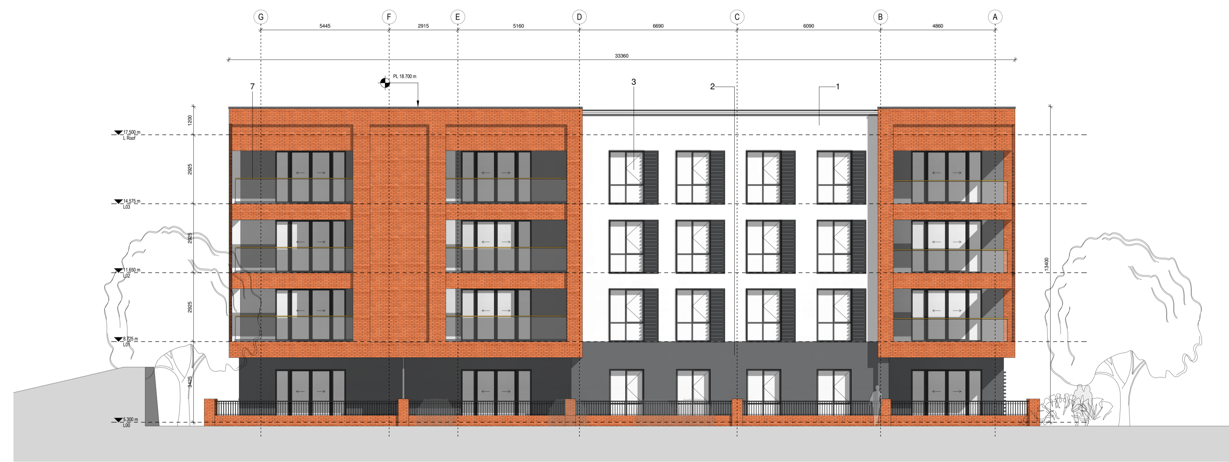
1 ELEVATION.C 1 : 100 1:200@A3