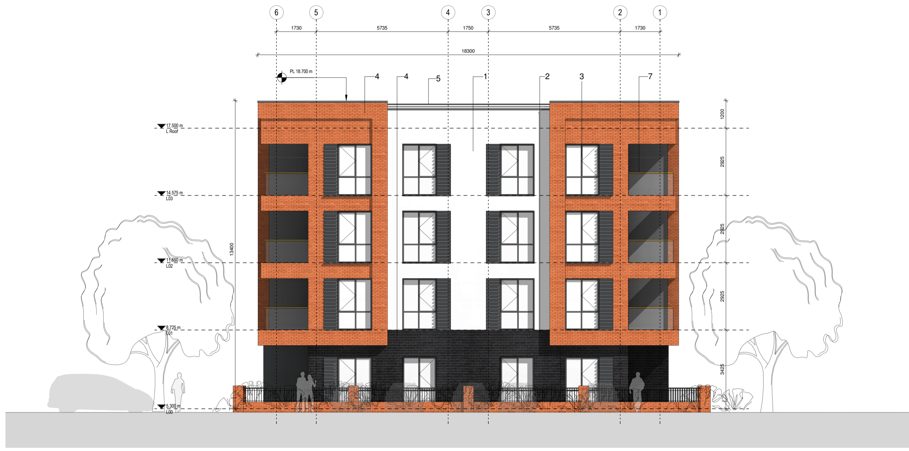
2 ELEVATION.D 1 : 100 1:200@A3